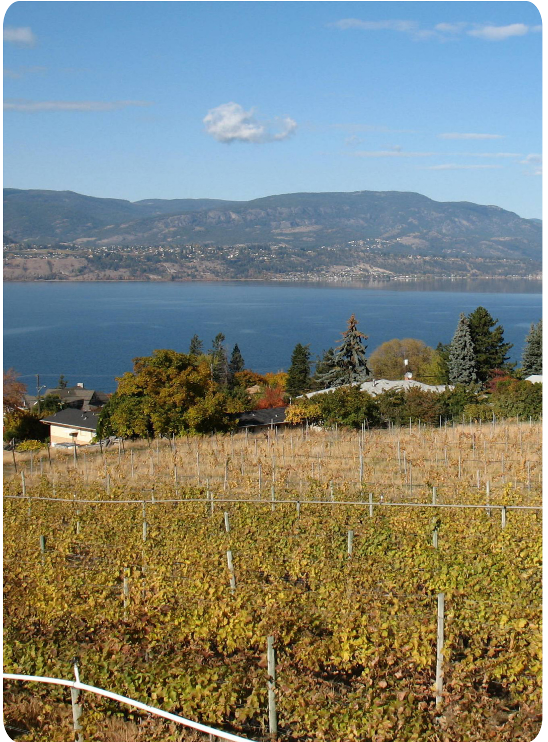
Agriculture and urban development in the Okanagan Valley